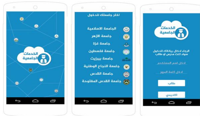
Figure 1 the first interface is the main interface for the application, the second interface to choose your university, the third interface is for login.

This is the first screen on the application. It is the gate to the application services. In this screen student enters student ID and password to login as shown in Fig. 1.