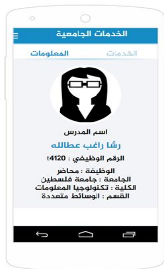
Figure 4 Academic Staff Information Interface

The survey answered by 220 students and 51 academic staff with different levels, gender and different phones types such as: Galaxy Tab, Galaxy S3, Galaxy S4, Galaxy Ace, Nokia Lumia 920 , iPhone 4, iPhone 4S, iPhone 5, Sony Xperia z2, Sony Xperia m and HTC.