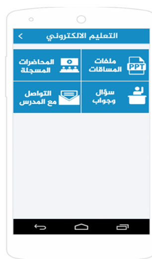
Figure 5 ELearning Interface

The survey emphasize that MCCAS satisfies academic staff and student needs and run with high performance and compatible with all OS devices and achieve the main objective of our project.